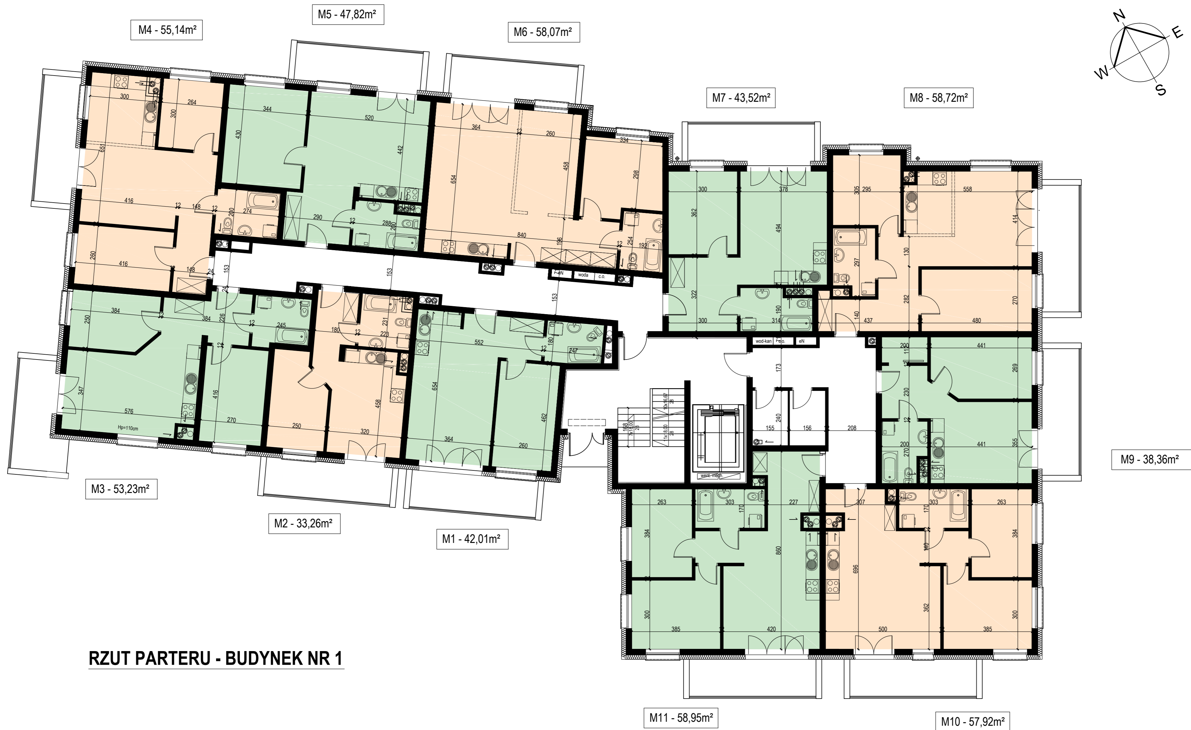
RZUT PARTERU - BUDYNEK NR 1